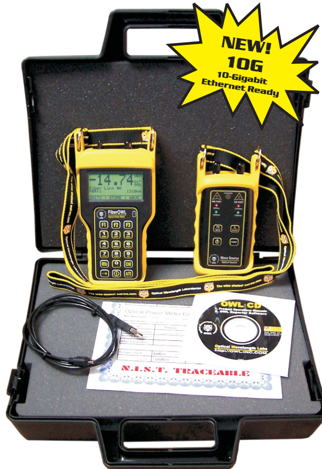
Connector styles or placement may vary from photo

Two connector options are available (ST and SC).